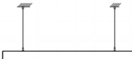
4.Adjust the position of the fixture and clean it.